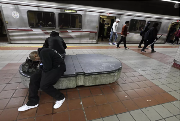
A man sleeps on his belongings at the MacArthur station in Los Angeles on March 28, 2023.