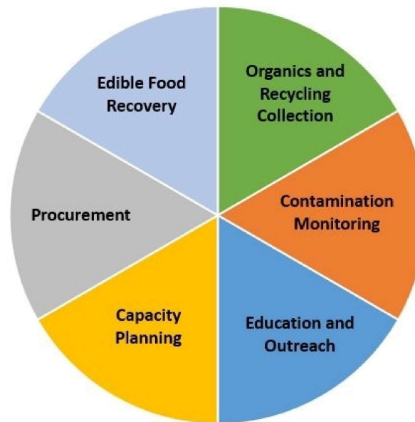
The 6 Main Elements of SB 1383