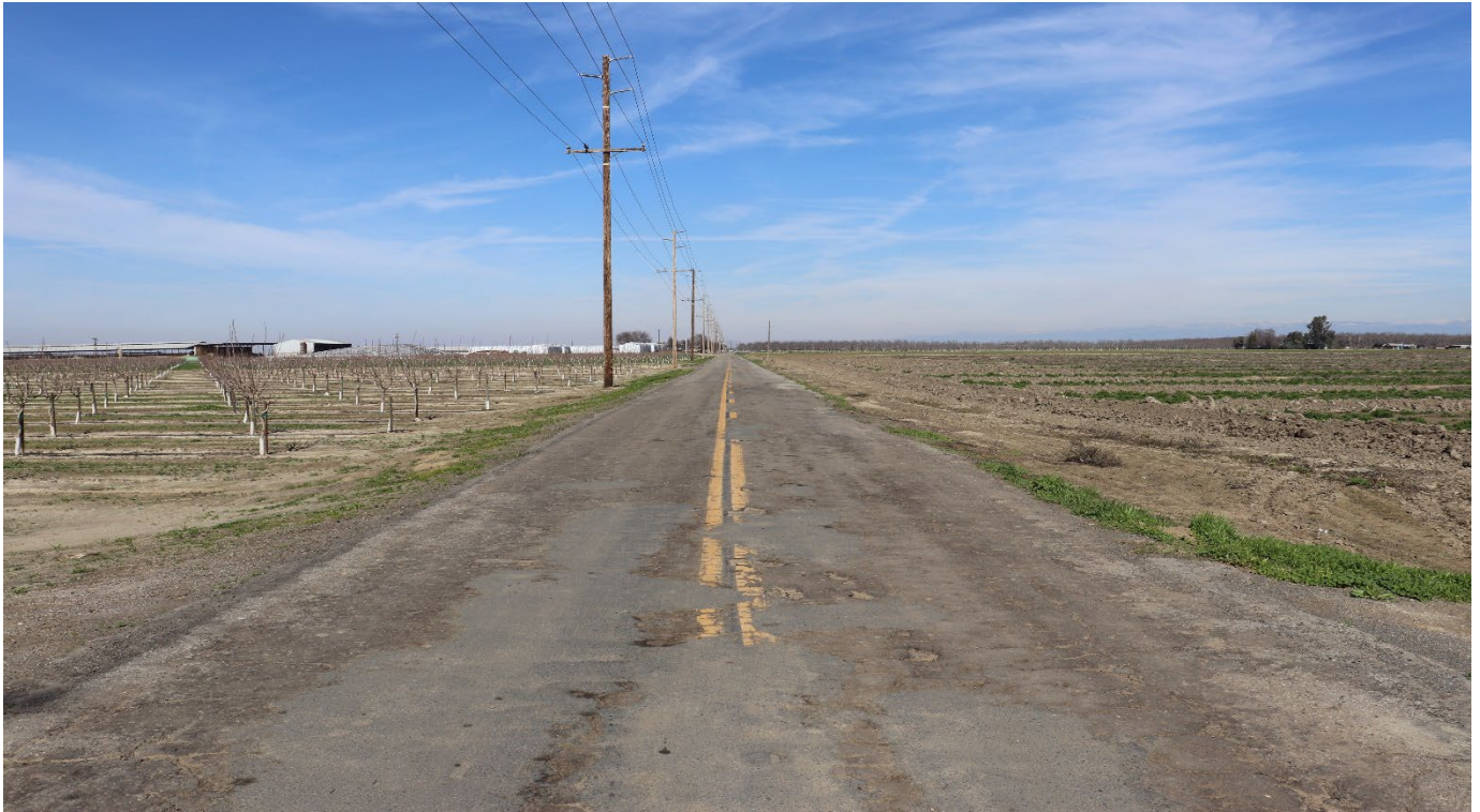
Before Roadwork – Location 2 Road 56