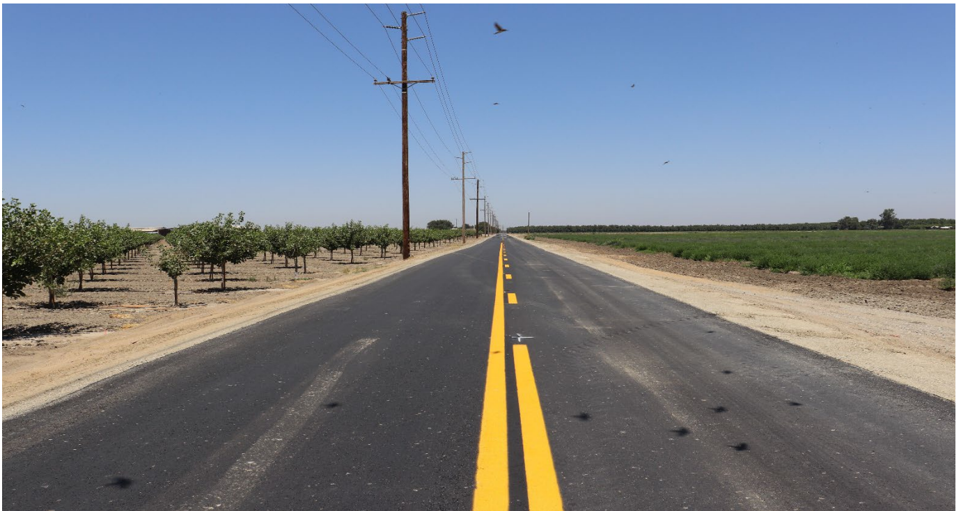
Completed Roadwork – Location 2 Road 56