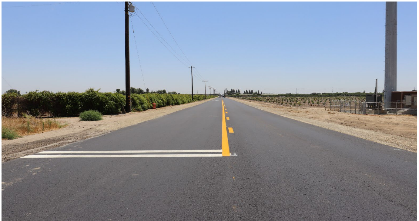
Completed Road – Location 1 Road 156