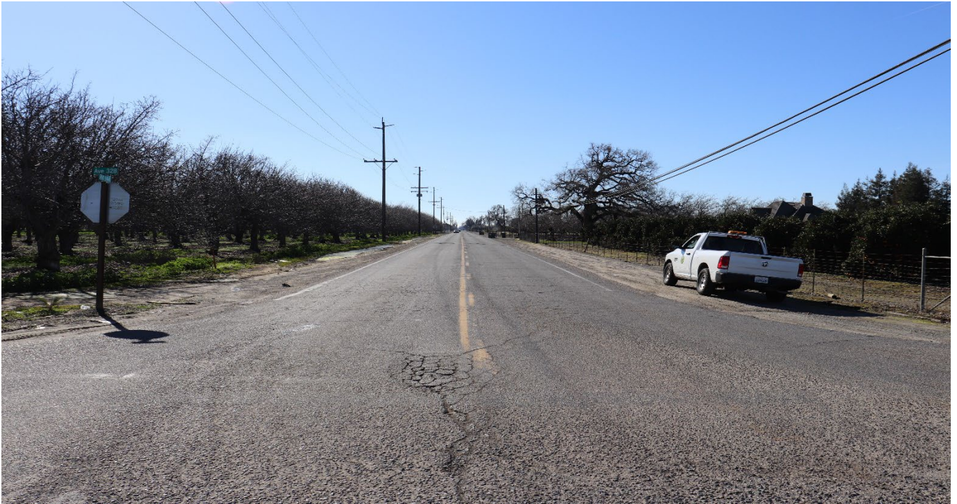
Before Roadwork – Location 4 Road 144