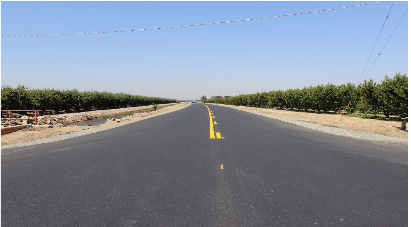
After Roadwork – Location 3 Avenue 408