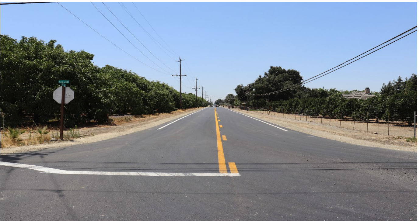
After Roadwork – Location 4 Road 144