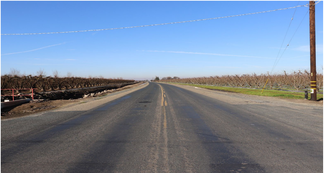
Before Roadwork – Location 3 Avenue 408