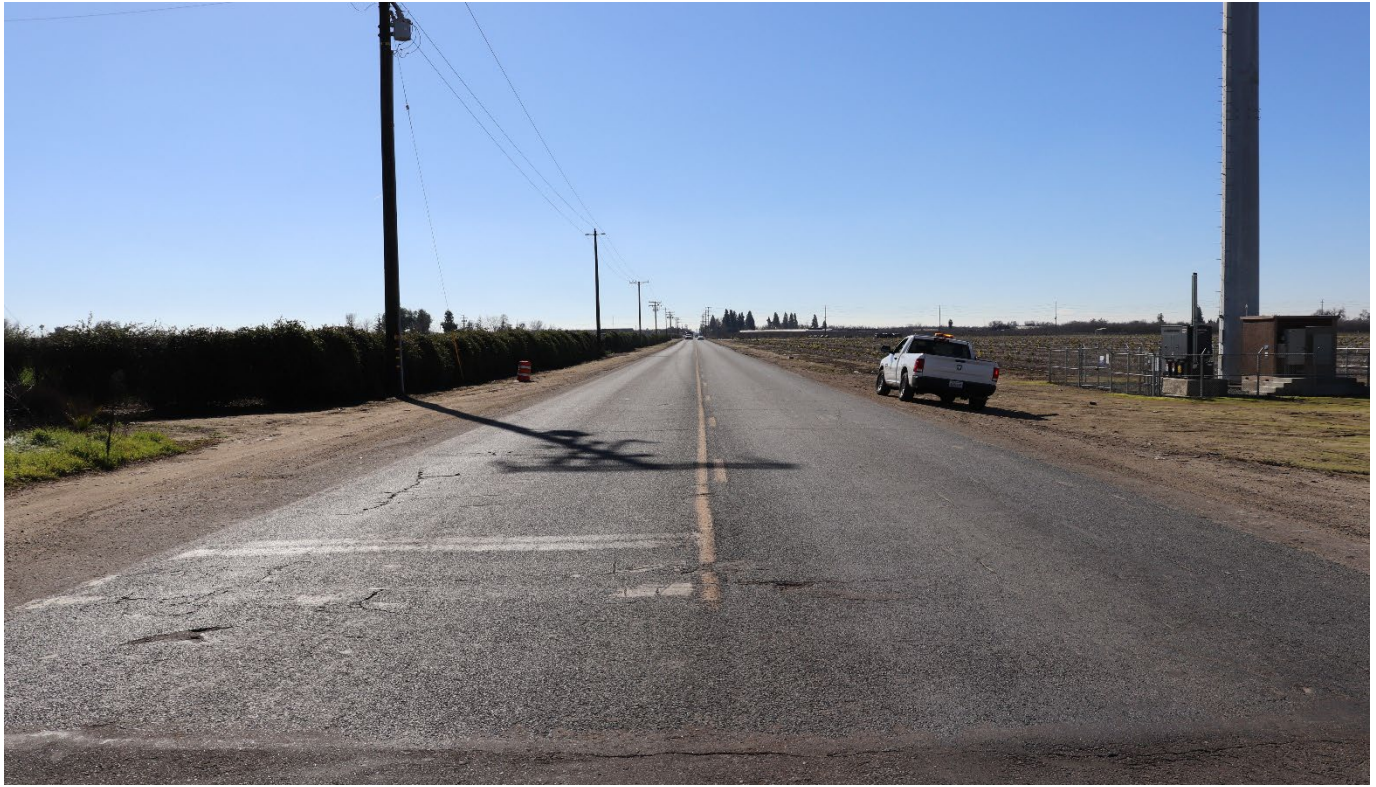
Before Roadwork – Location 1 Road 156