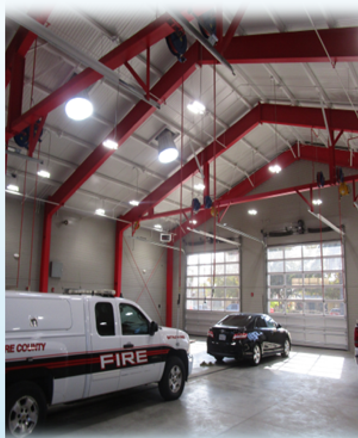
Terra Bella Fire Station Remodel