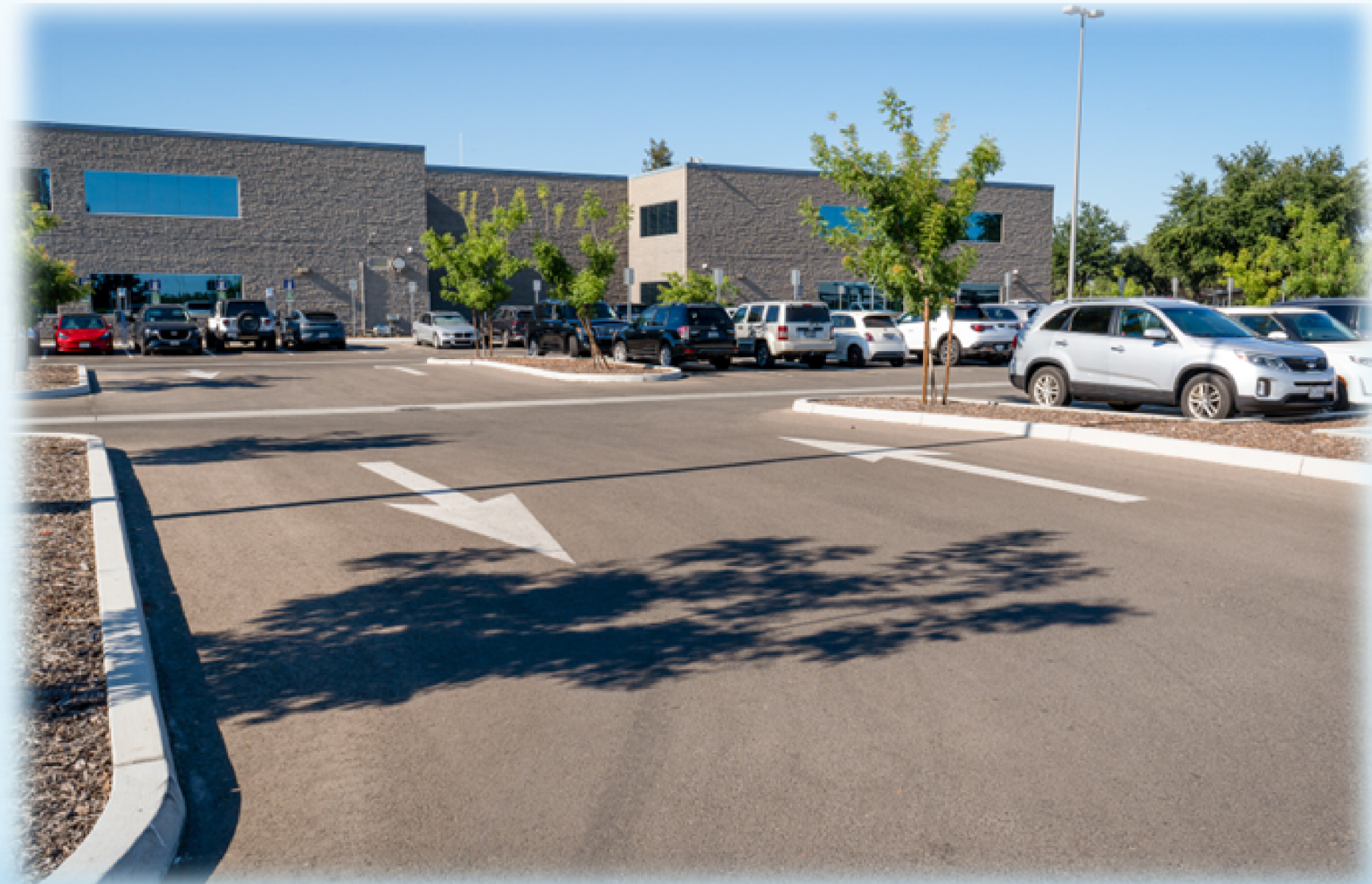
Government Plaza Parking Lot Phase I