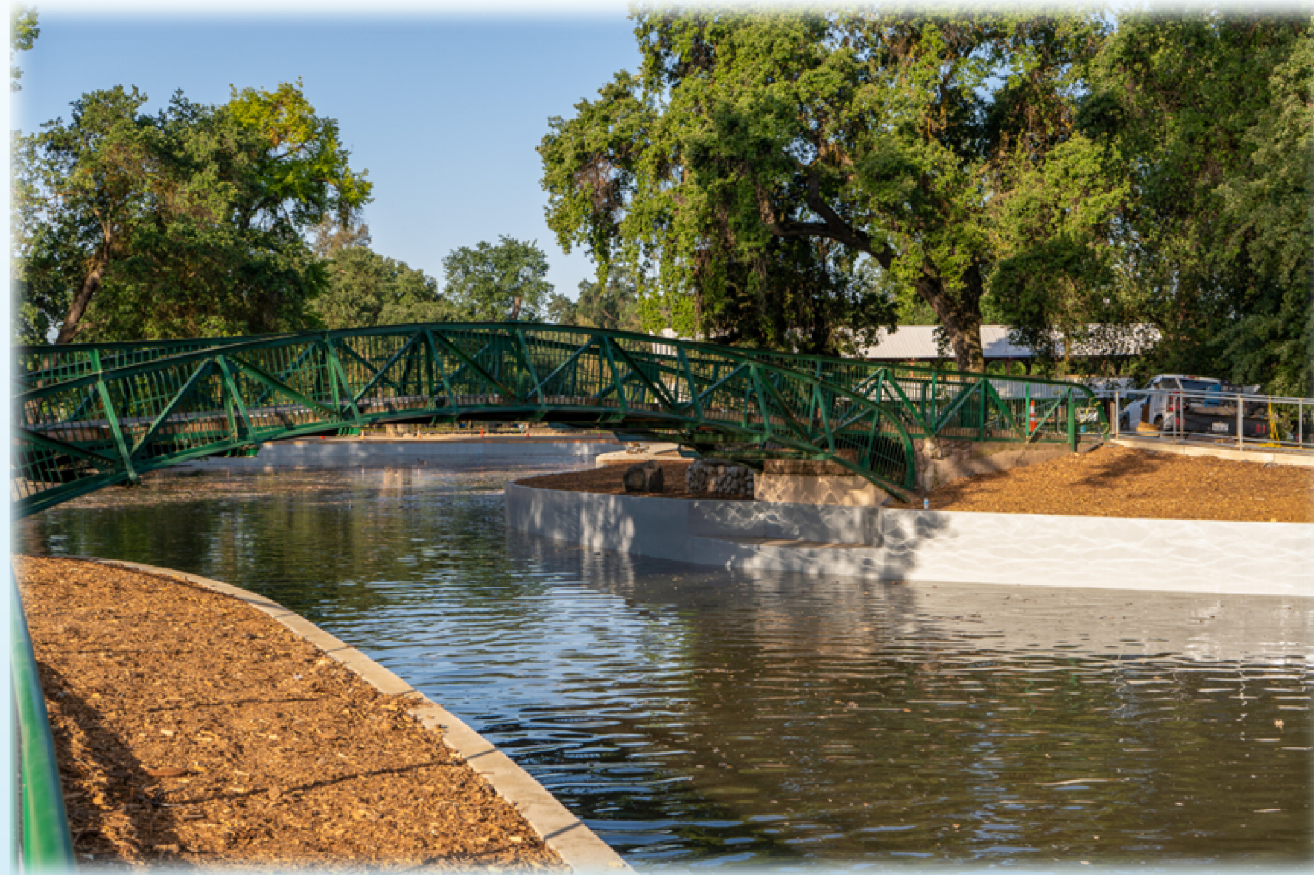
Mooney Grove Pond Renovation