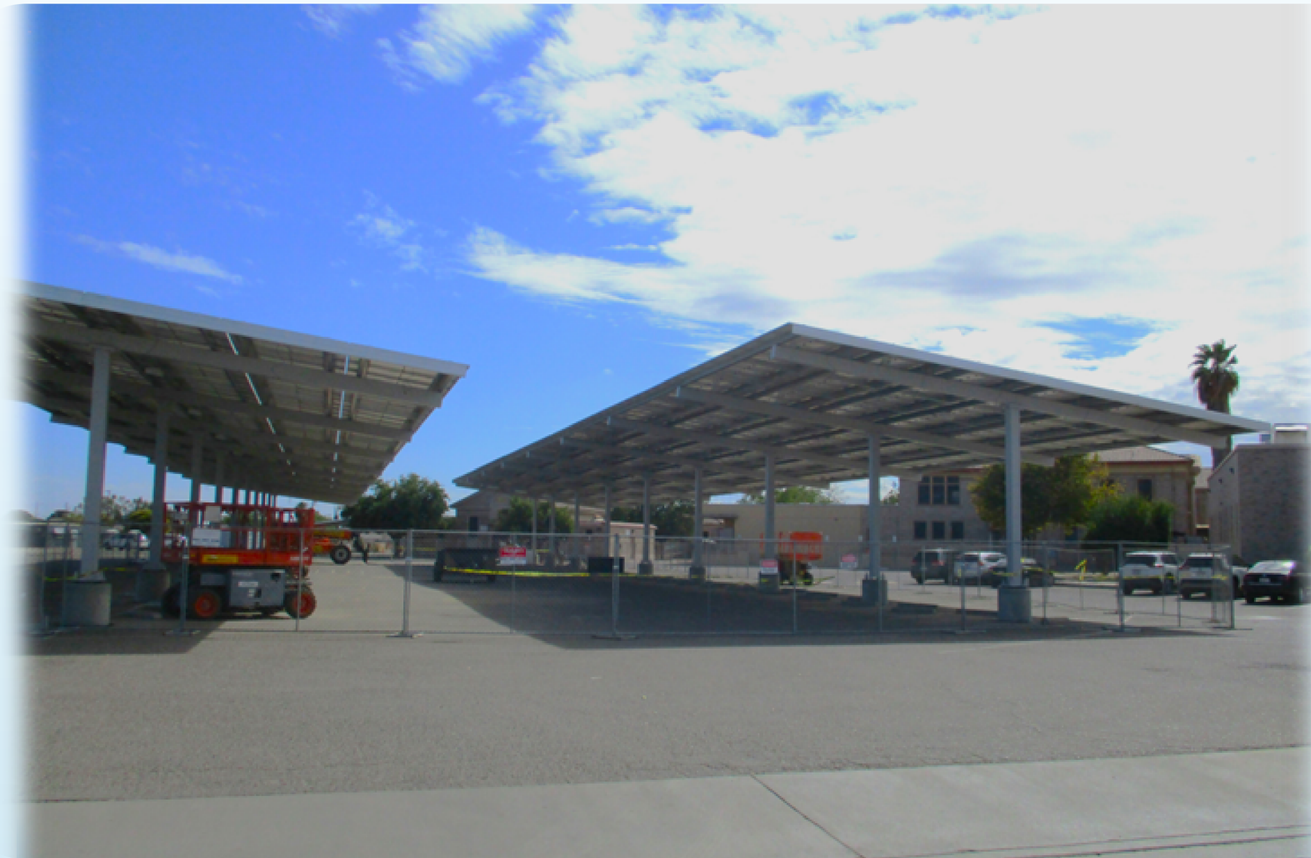
Solar at Hillman Campus