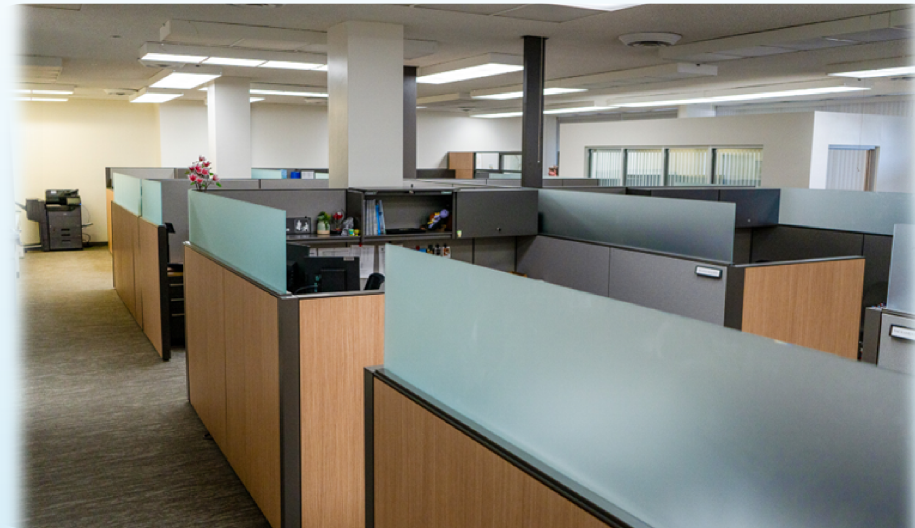
Auditor–Controller Treasurer–Tax Collector Remodel