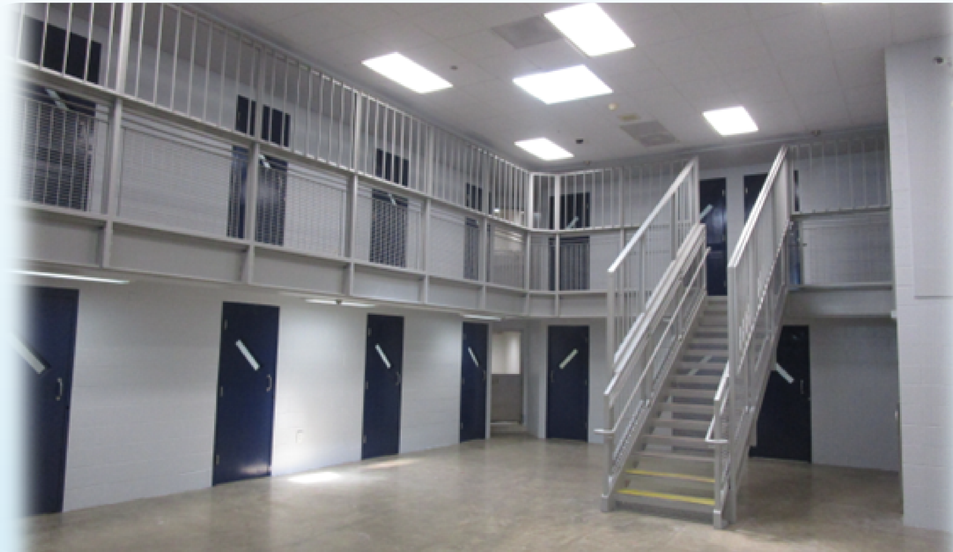
Juvenile Detention Facility Interior Improvements