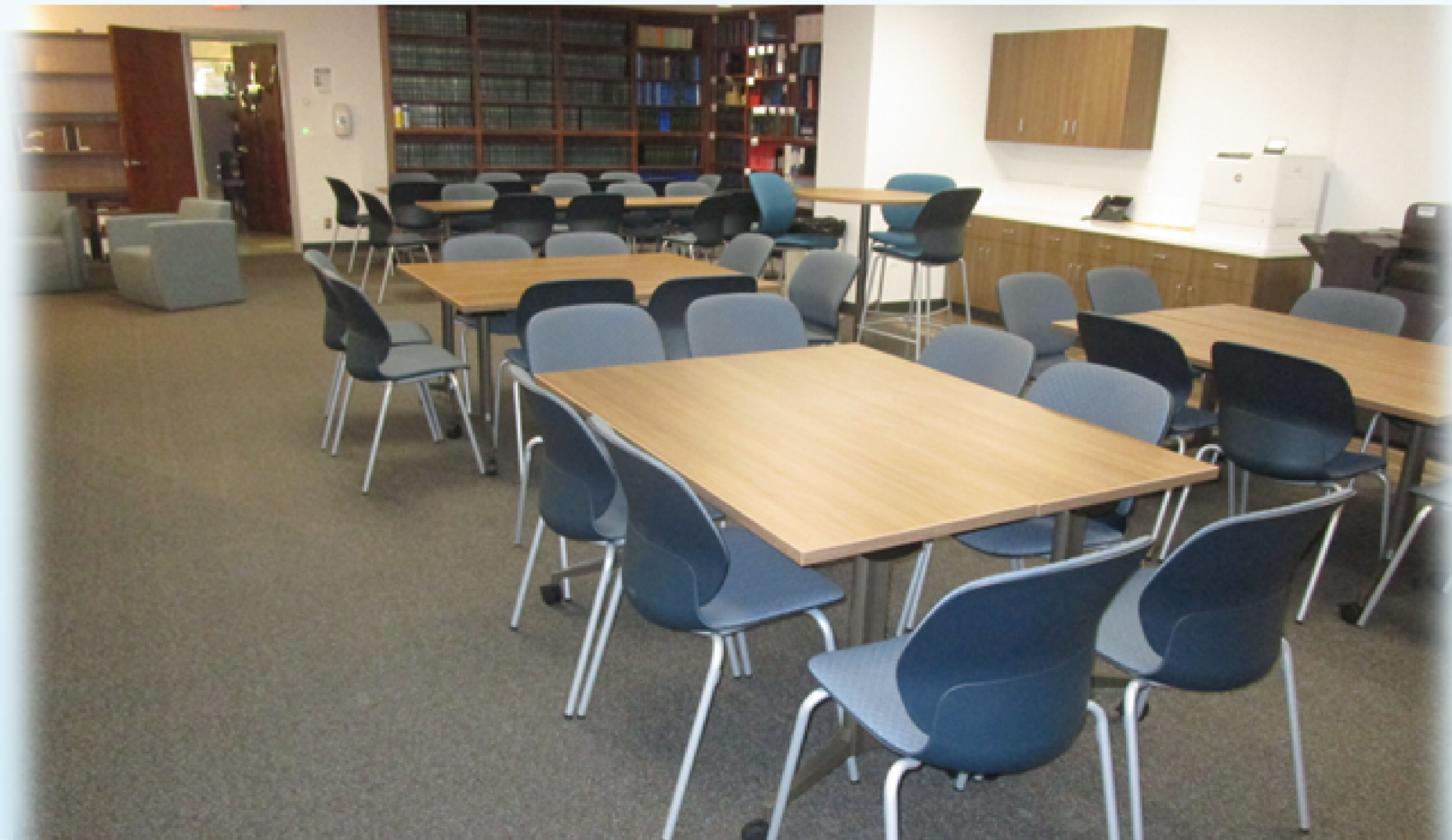
Public Defender Multi-Purpose Room