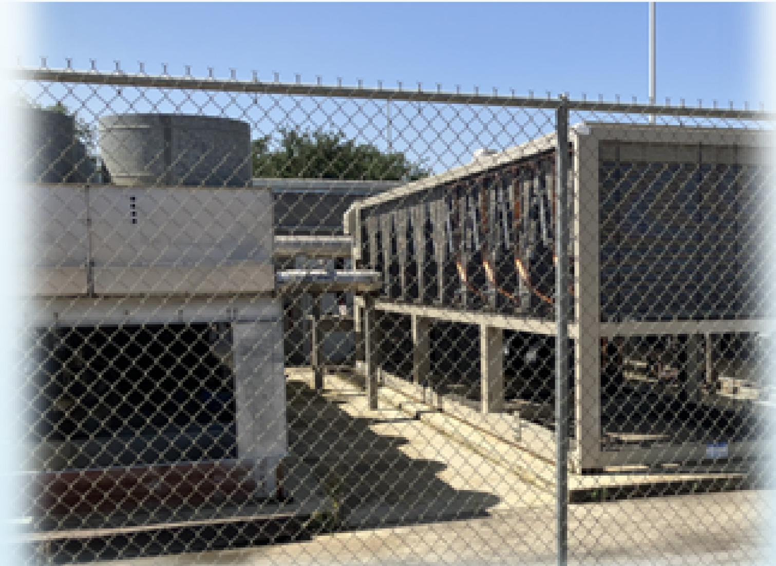
Government Plaza HVAC Project