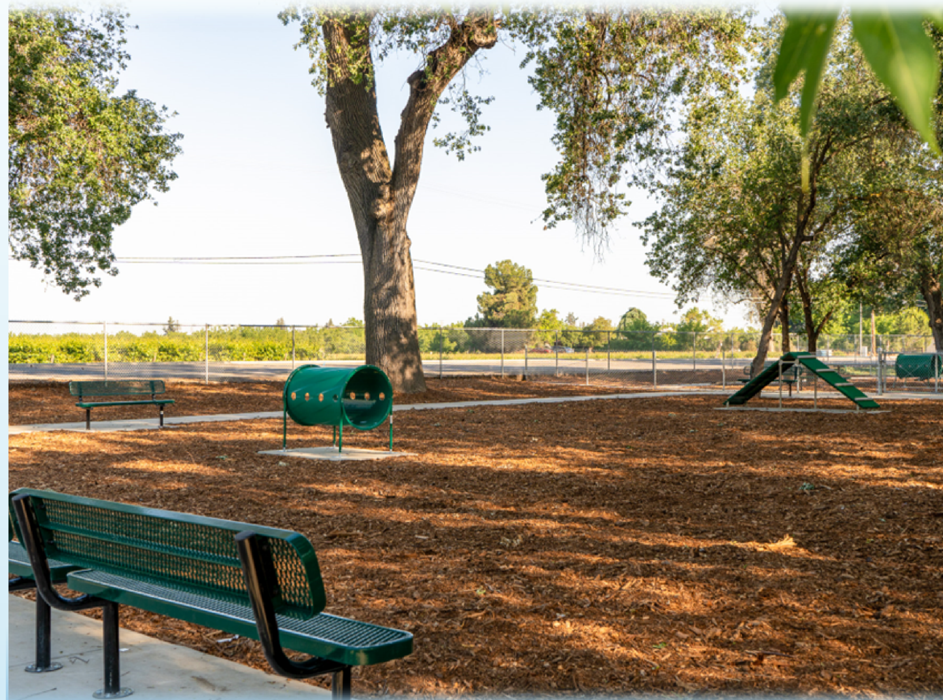
Mooney Grove Dog Park