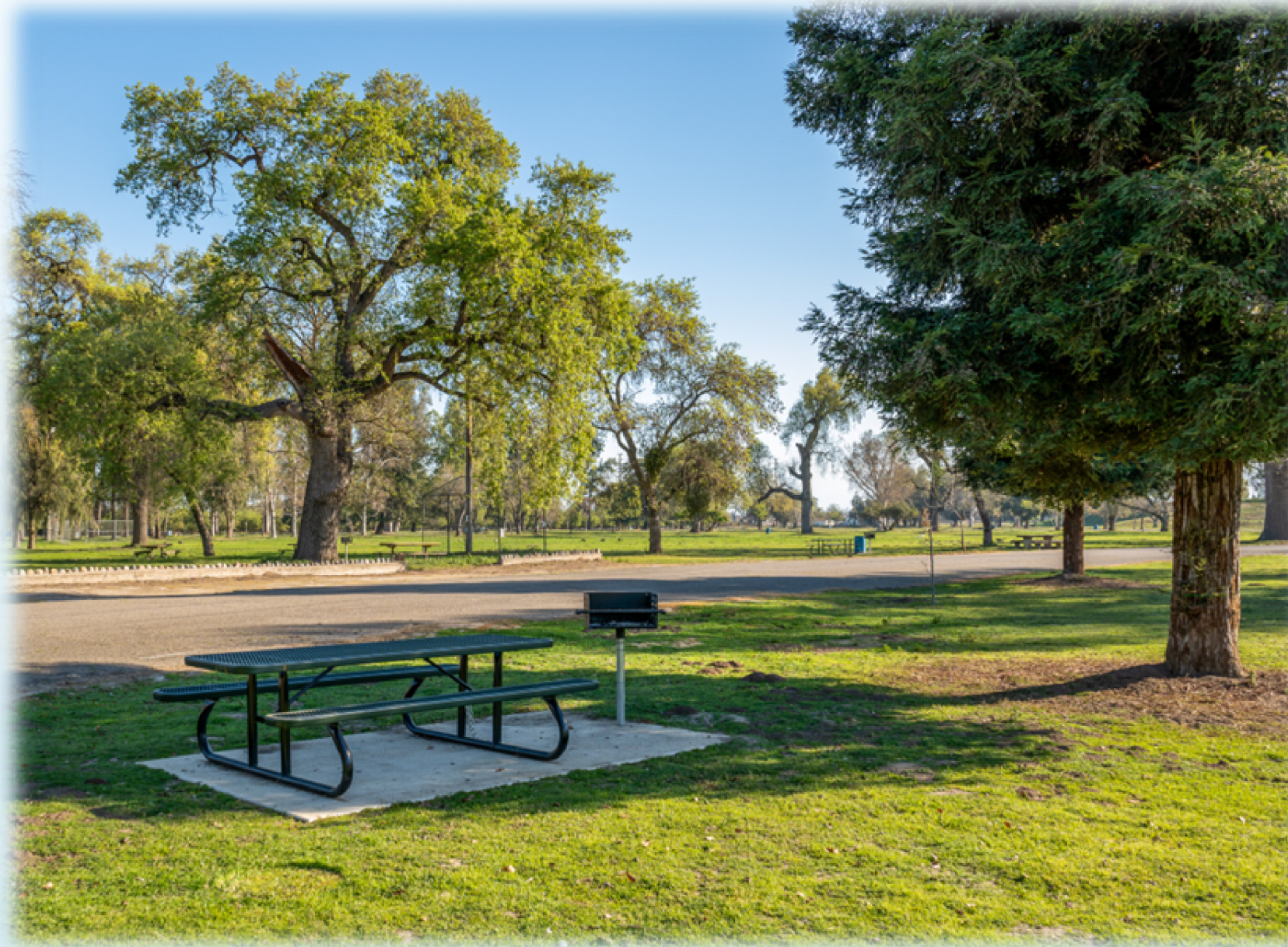
Picnic Tables & Grills