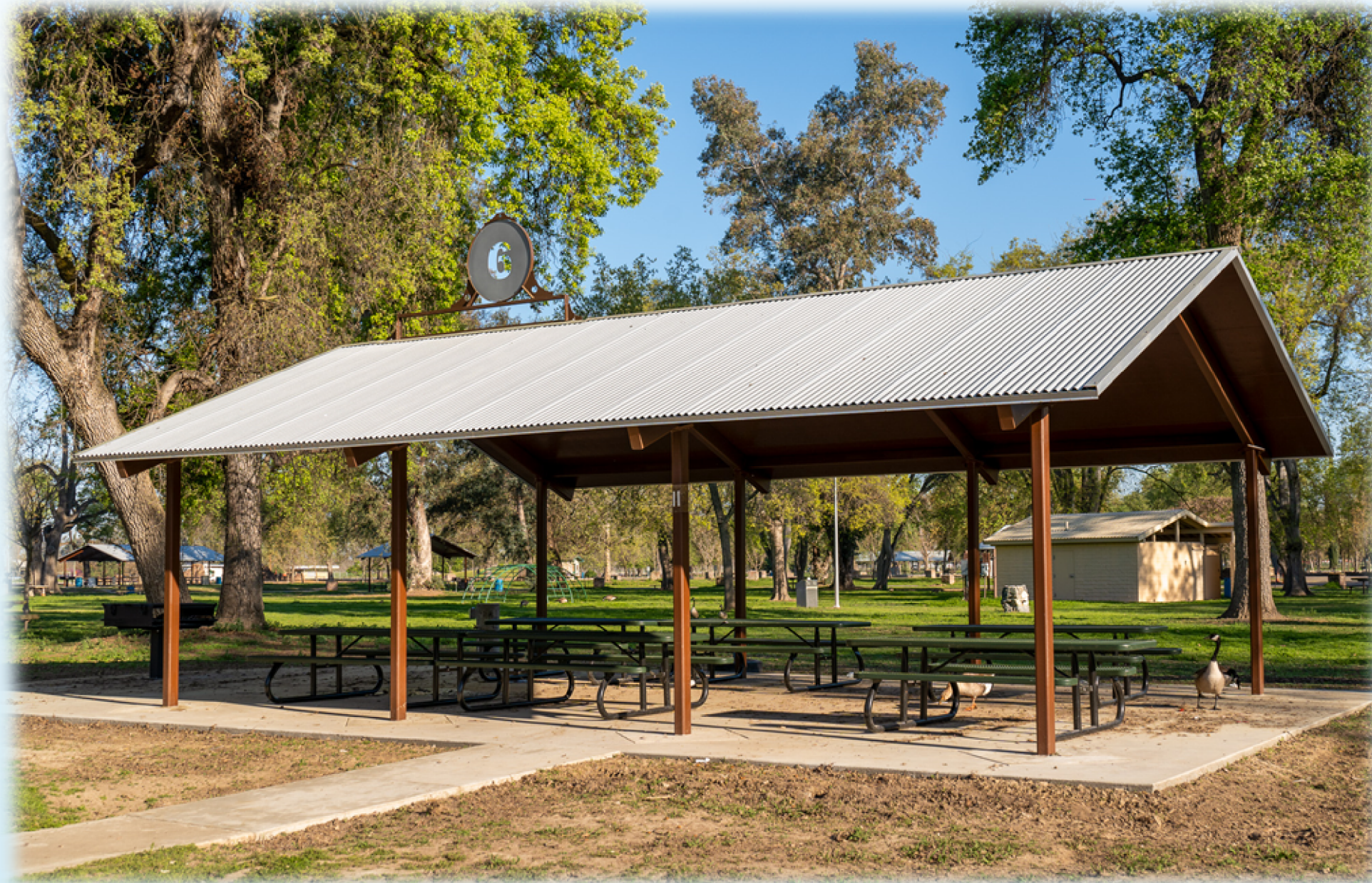
Arbor Repairs and Replacements