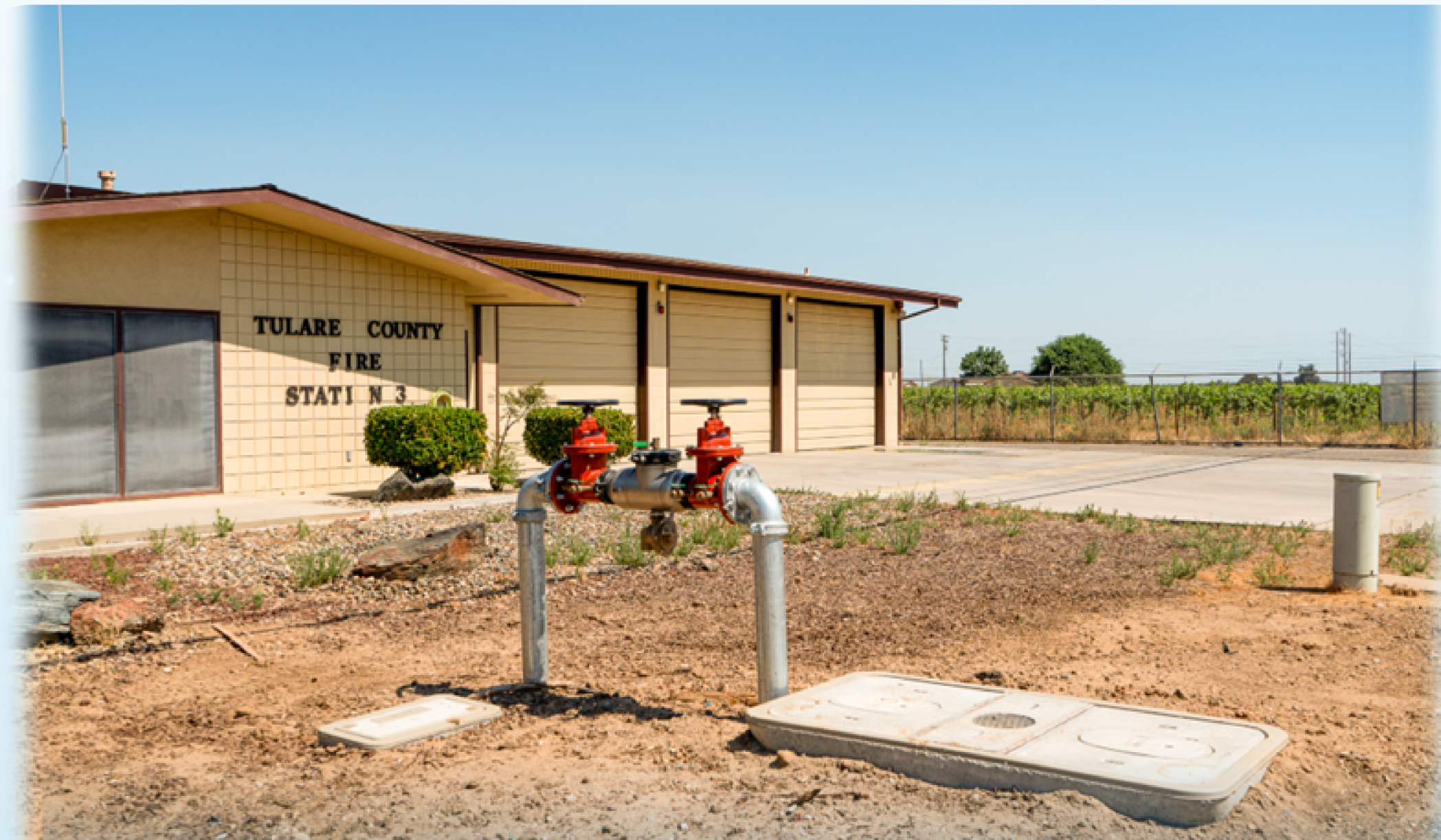
Dinuba Fire Station Water