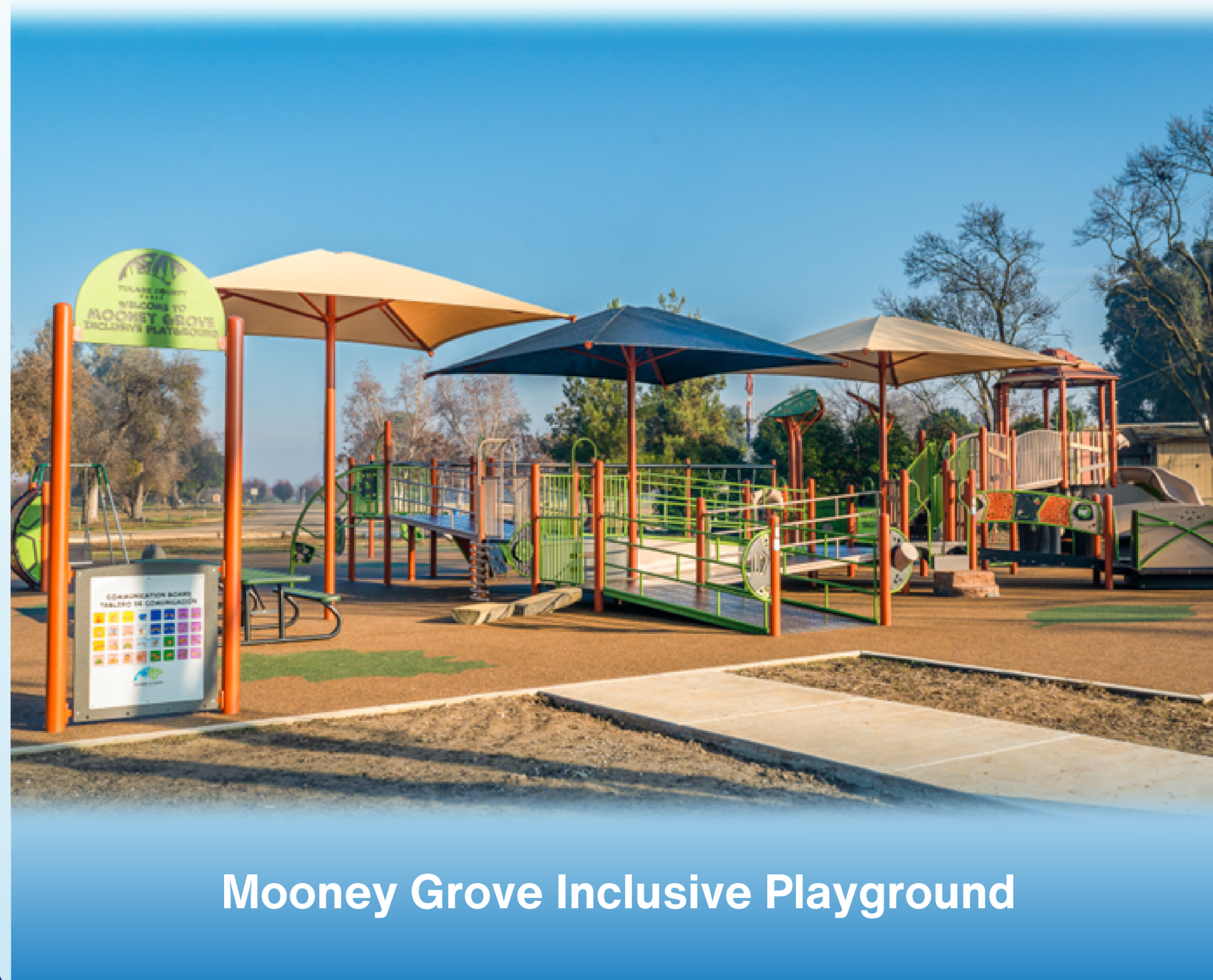
Mooney Grove Inclusive Playground