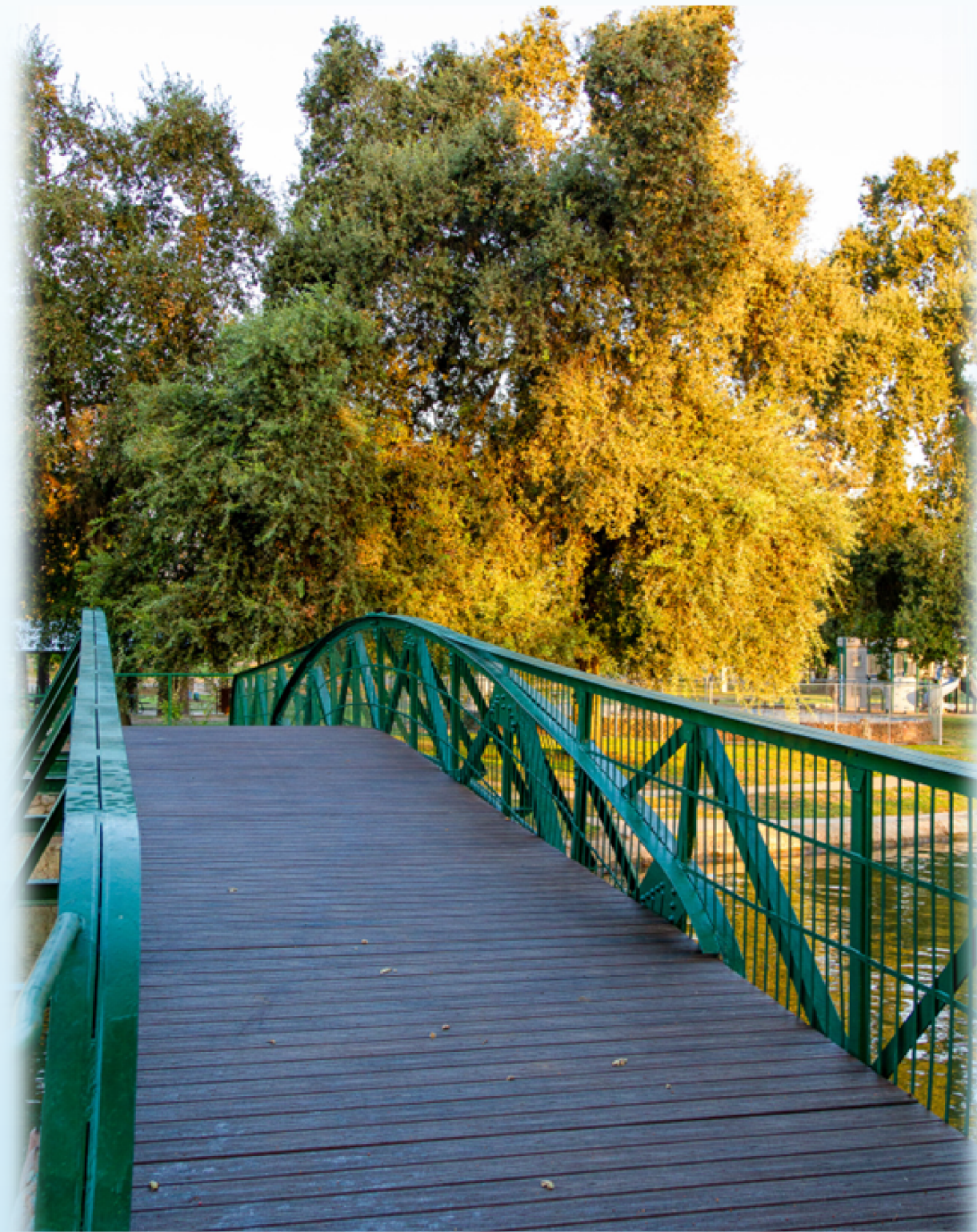
Mooney Grove Bridge Renovation