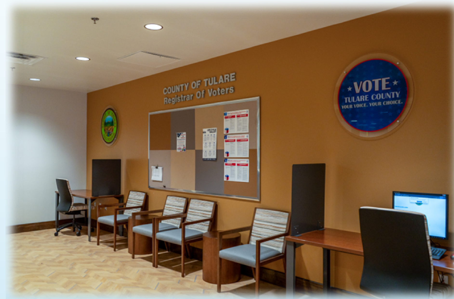
Registrar of Voters