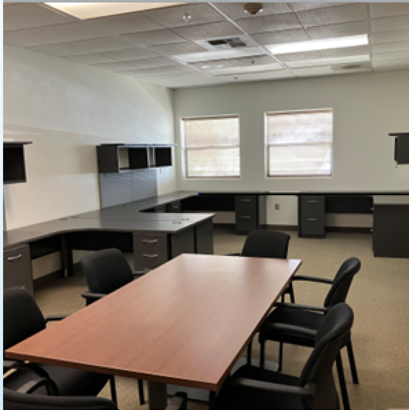
Porterville Substation Relocation