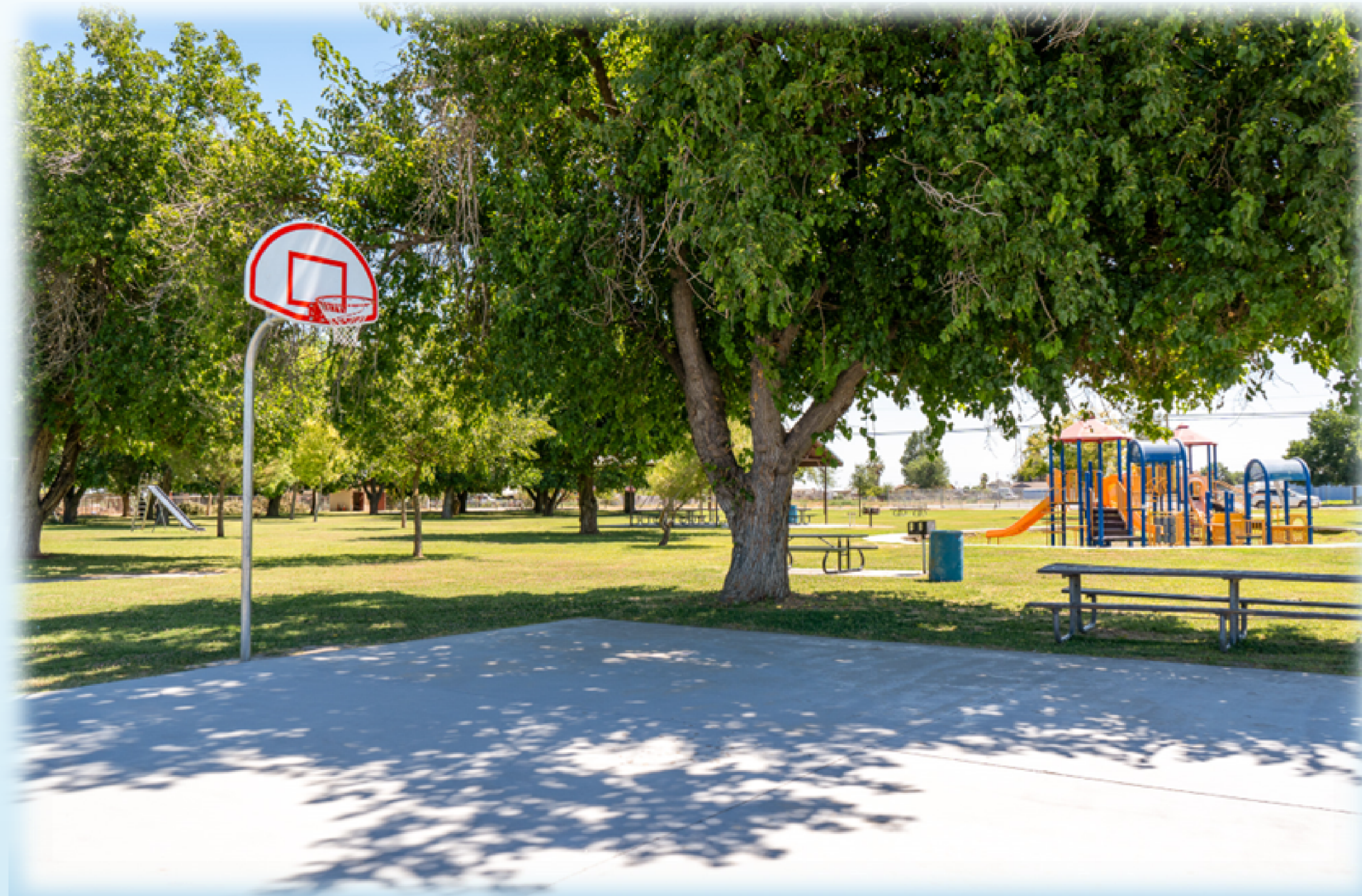
Alpaugh Basketball Court