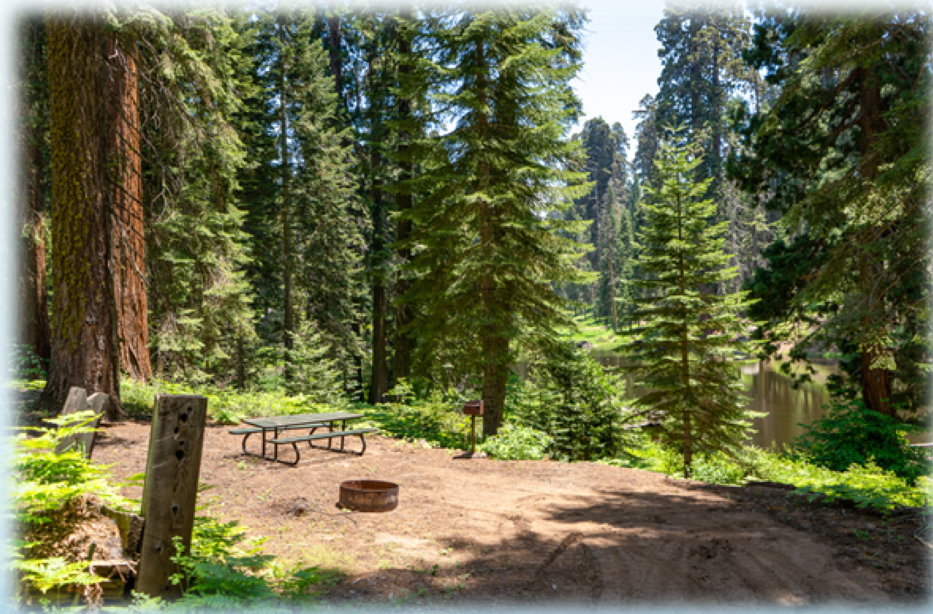
Balch Picnic Tables & Fire Rings