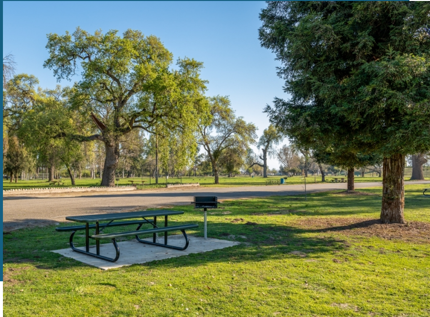
Mooney Grove Park