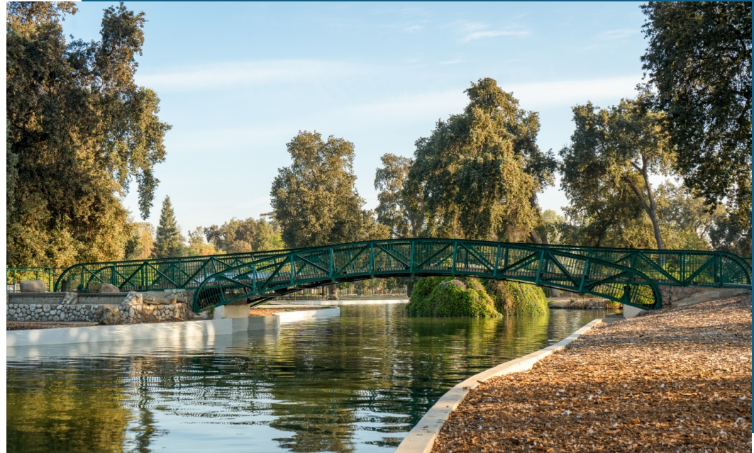
Mooney Grove Park