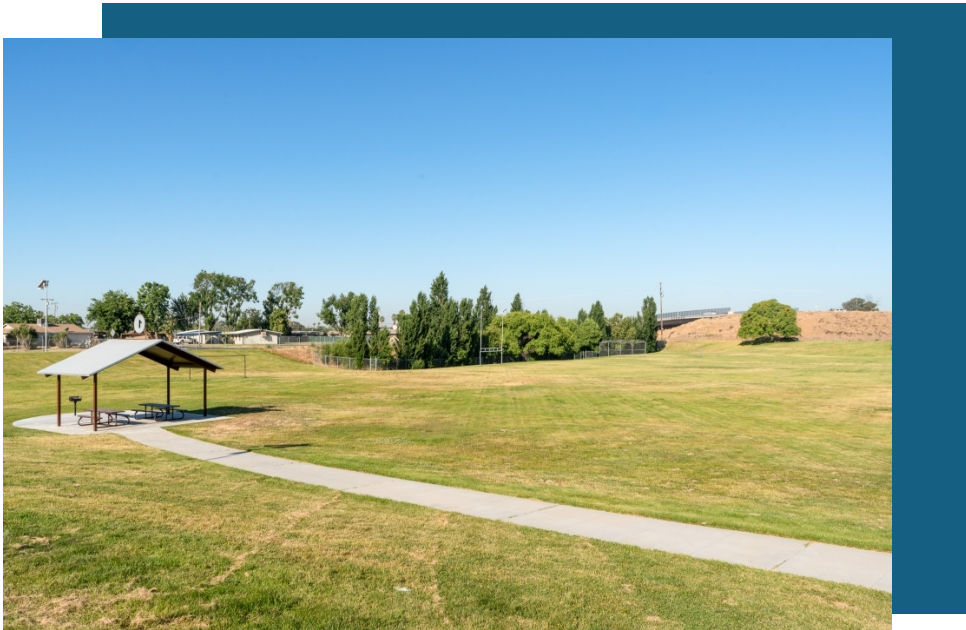
Community Park of Goshen