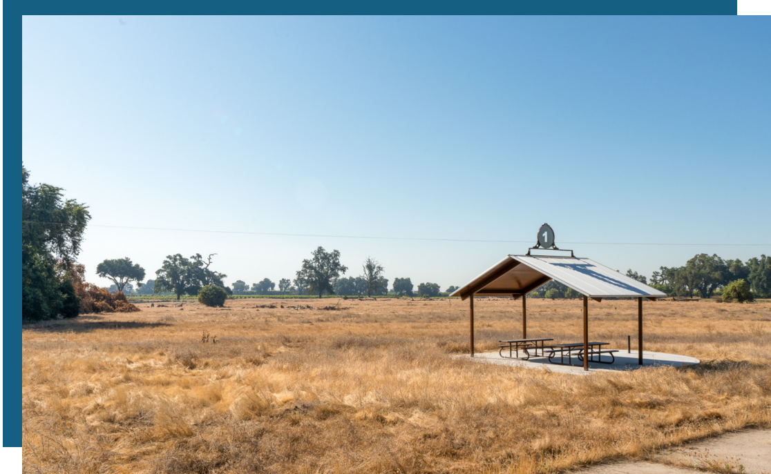
Kings River Park