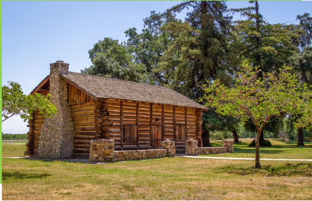
Mooney Grove Park