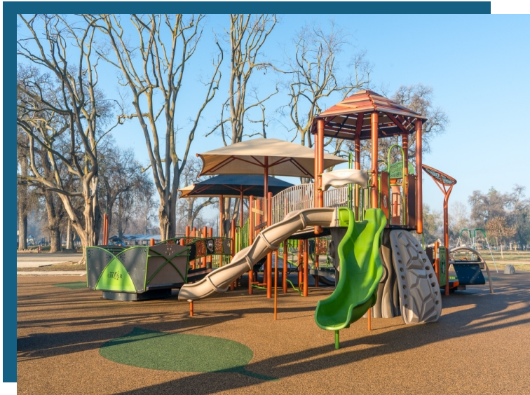
Mooney Grove Park