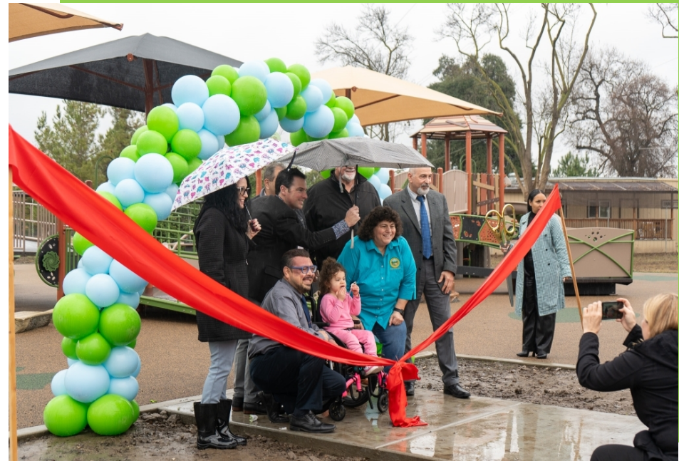
Mooney Grove Park