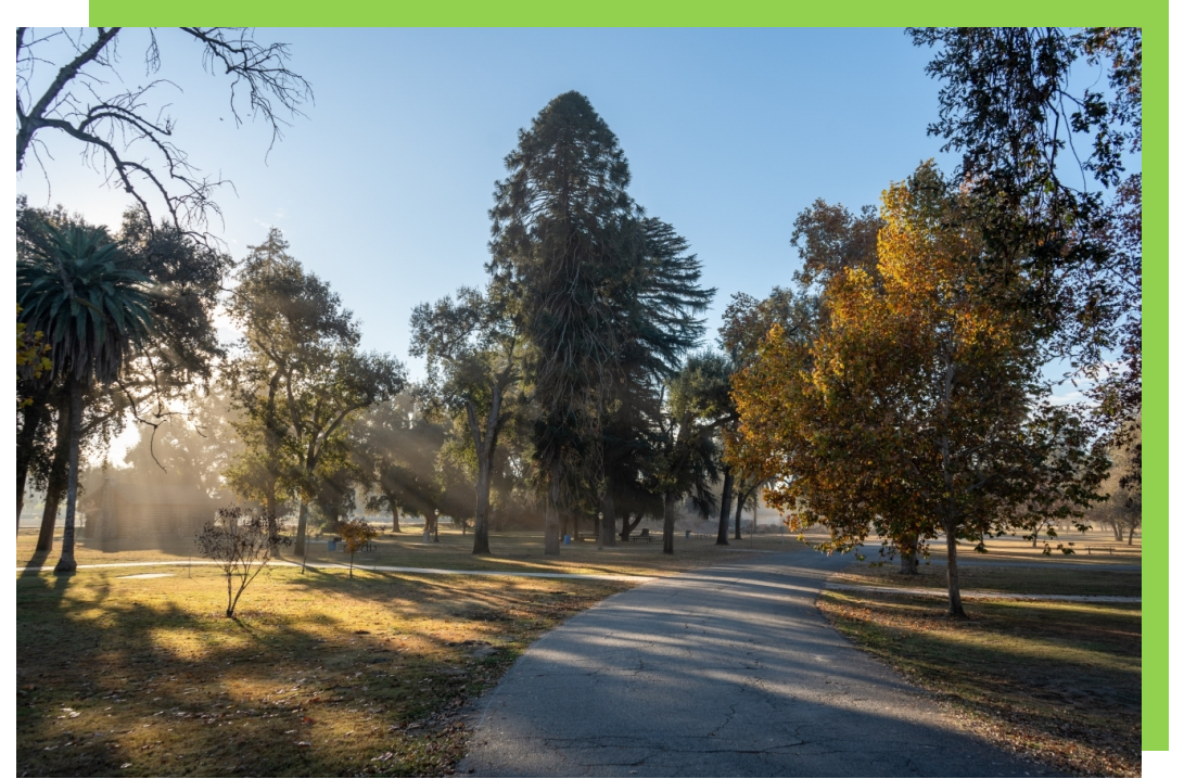
Mooney Grove Park

These events may be subject to additional fees.