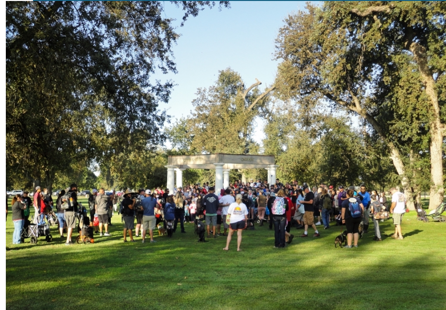
Mooney Grove Park