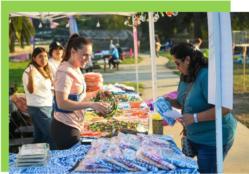
Mooney Grove Park